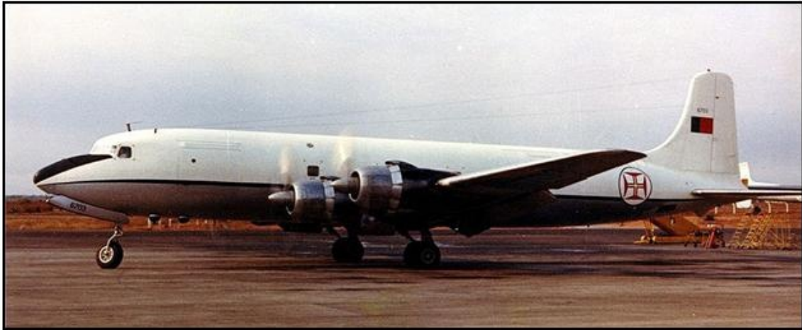
Photograph 1 - Douglas DC-6A Cloudmaster , FAP Serial 6703, Taxiing in Luanda

In 1961, Pan American World Airways was facing a decision about whether to conduct a major overhaul on two of its high-flight-hour Douglas DC-6A (cargo) and eight of its DC-6B (passenger) Cloudmaster transport aircraft or simply to retire them. Coincidentally, Portugal was looking for a more capable aircraft to augment the C-54, and these were made available. The DC-6 Cloudmaster and its military version, the C-118 Liftmaster , were developed as faster, larger, pressurized versions of the C-54, and in fact, the initial model was a cargo transport. When the powerful Pratt & Whitney R-2800-CB-17 “Double Wasp” radial engine became available, Douglas engineers decided that they could extend the fuselage of the DC-6A by 4.5 feet to produce the DC-6B, a major advance in passenger aircraft. The “Double Wasps” were the most efficient piston engines available at the time and gave the aircraft the best operating economies of any large contemporary piston airliner. Likewise, passengers and crew appreciated its relative quietness, smoothness, and general comfort over others in its generation.