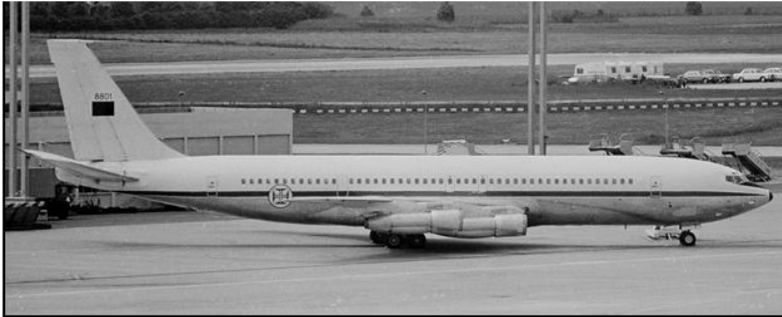
Photograph 2 - B-707, FAP Serial 8801, Parked on Ramp in Lagos