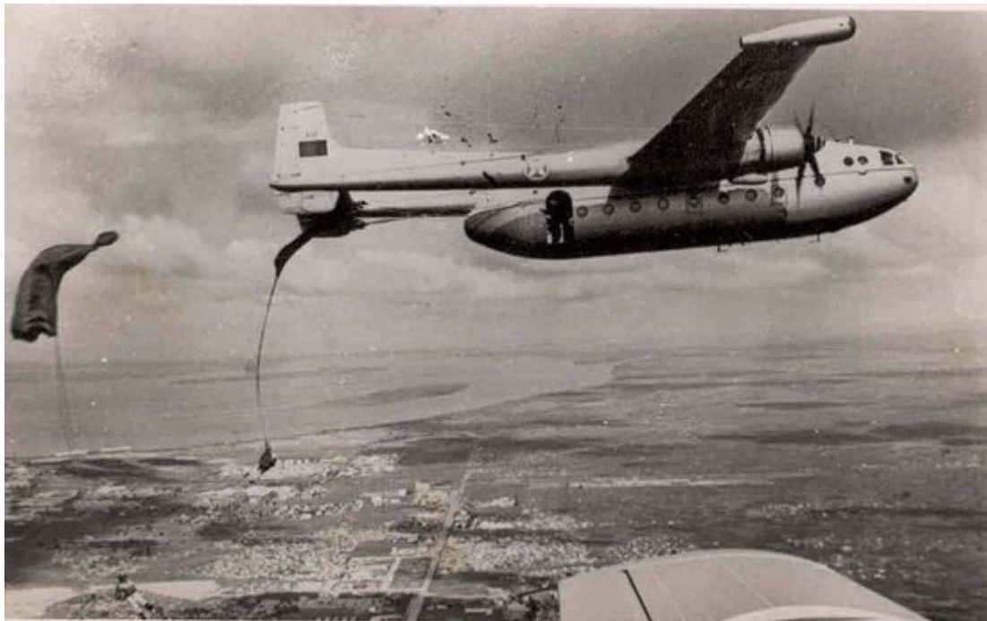
Photograph 4 - Nord Aviation Noratlas Dropping a Stick of Paratroops

In the ultramar , the Dakotas would show their versatility and be used for many types of missions, such as aerial reconnaissance, paratroop drops, medical evacuation, and search and rescue. They were even used as makeshift bombers in Guiné, including night missions, and in psychological operations in Mozambique 27 . While the Dakota had proven itself time and again, it had severe limitations in that its load capacity was relatively modest, and its maintenance was becoming an increasing problem because of its age as a World War II-vintage machine. No matter its venerable history, the Dakota clearly had its limits.